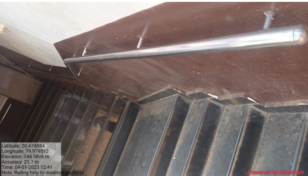
Railing help to disabled students