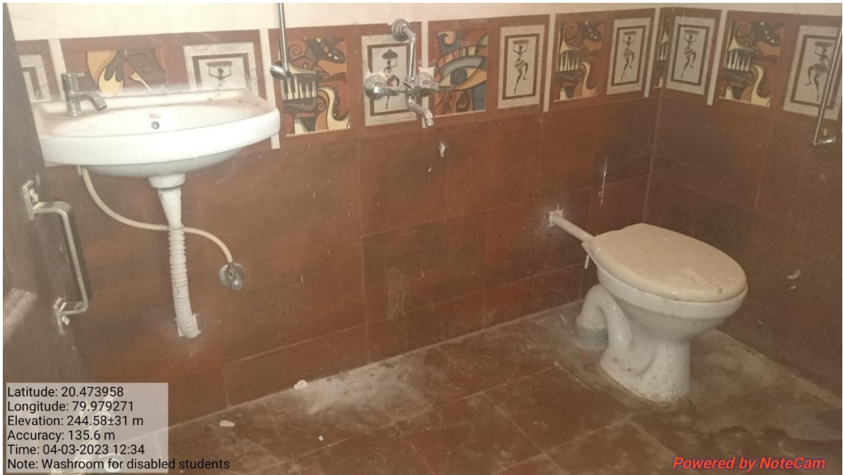
Disabled friendly Washroom