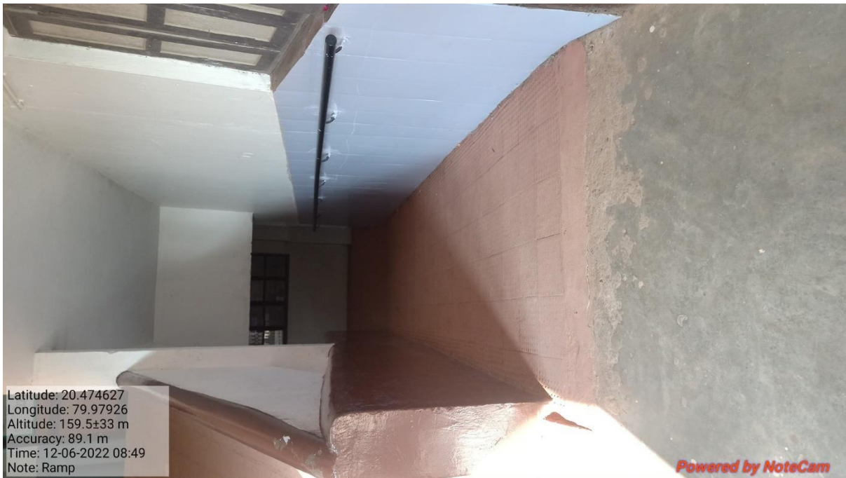
Ramp for easy access to classroom